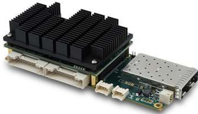
EPS-12002L-HSK with integrated heat sink