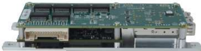
EPS-12002L-HSP with heat spreader mounting plate