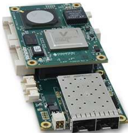
EPS-12002L switch end view, cooling solution removed