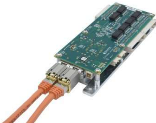
EPS-1202L-HSP with heat spreader and Copper 10G SFP+