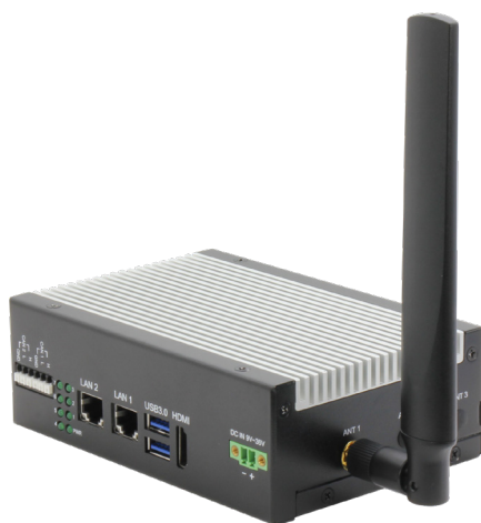
With Antennas installed