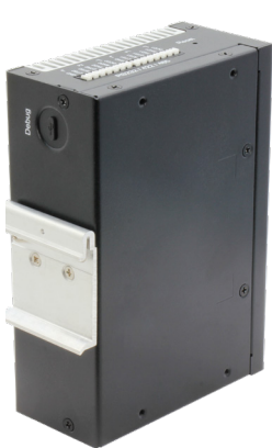
DIN-Rail Mount Illustration