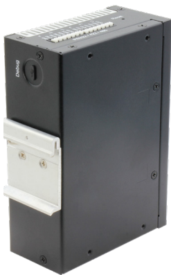
DIN-Rail Mount Illustration