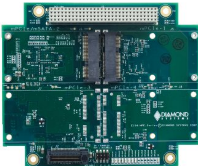
E104-MPE-02 top view

The PCIe MiniCard carrier provides four PCIe MiniCard sockets on a PCI/104-Express form factor board. All four sockets have PCIe x 1 and USB interfaces and support full size and half size PCIe MiniCard modules.