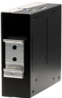
DIN-Rail Mount Illustration