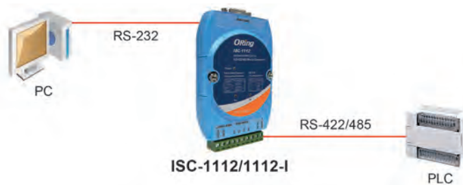
Connections of Serial Media Converter

ISC-1112 series are industrial media converters provide media conversion between RS-232 and RS-422/485 interface. ISC-1112 series are ABS housing design and supporting an operating temperature of -10 to 70°C. The RS-485 control is completely transparent to the user and software written for half-duplex operation without any modification. ISC-1112-I opto-isolators provide 3000VDC of isolation to protect the host computer from destructive voltage spikes. Therefore, the ISC-1112 series is reliable serial media converter and can satisfy most demand of operating environment.