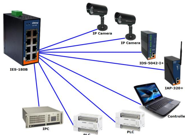
Connections of Ethernet devices

IES-180B can be used in connecting several Ethernet devices like Ethernet I/O, IP-Camera or other Ethernet switches. In addition, its mini size enables easily installation and minimize space requirement.