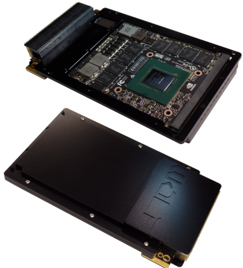
WOLF- 1116 VPX Module

The rugged VPX3U-TESLA-P6-HPC board includes air-cooled and conduction cooled options. For additional options contact WOLF to discuss MCOTS and custom design services.