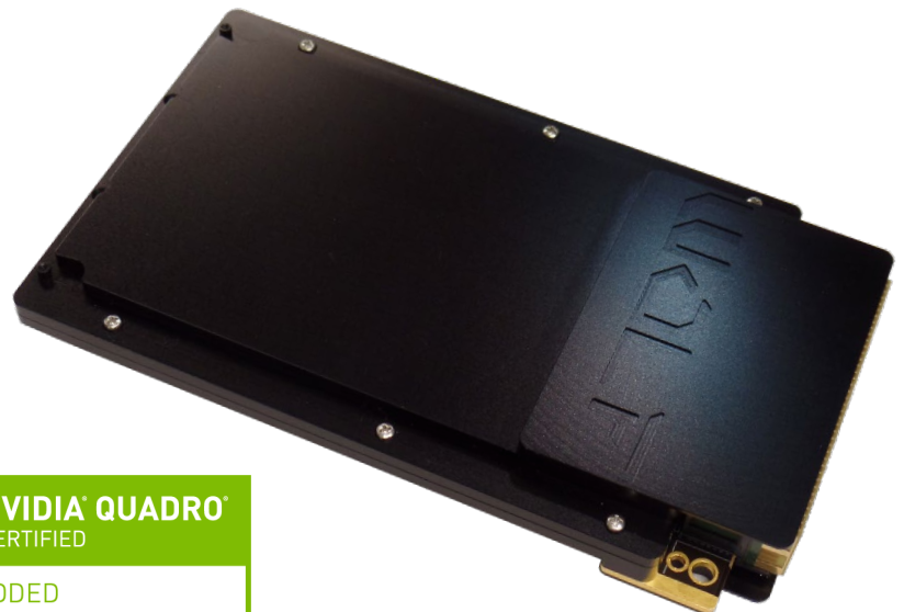
WOLF-1110 Chip-Down VPX Module

The WOLF Frame Grabber eXtreme (FGX) is the engine that provides the board with conversion of video data from one standard to another, with a wide array of video input and output options for both cutting-edge digital I/O and legacy analog I/O. The FGX has direct memory access (DMA) to the Quadro Pascal's GPU memory for GPU processing and complex analysis. By including both the versatile FGX and a high performance Quadro Pascal GPU on one board WOLF's I/O and processing solution avoids the SBC data rebroadcast traffic jams that commonly occur with a 2-board solution.