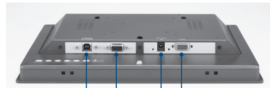
Touch Screen (USB) Touch Screen (RS-232) 100 ~ 240 V AC Power Adapter