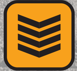
Military grade quality