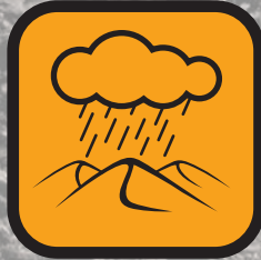
IP 65 Certified