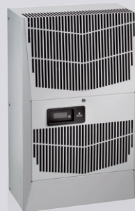
G28 Indoor/Outdoor 4000 & 6000 BTU/hr. 1172 & 1758 Watts