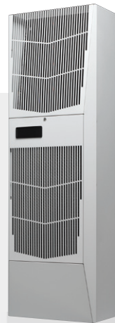
G52 Indoor/Outdoor 8000 & 12000 BTU/Hr. 2300 & 3500 Watts