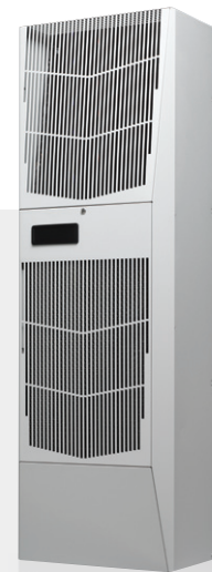
G57 Indoor/Outdoor 20000 BTU/Hr. 5900 Watts