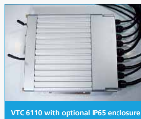
VTC 6110 with optional IP65 enclosure